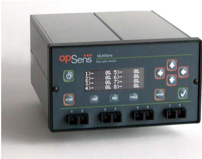
MULTI-CHANNEL, MULTI-PURPOSE SIGNAL CONDITIONER FOR LABORATORY APPLICATIONS

Use with Opsens' WLPI fiber optic sensors — • Pressure • Temperature • Strain • Position